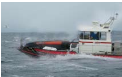
Polarcirkel RBB (Rigid Buoyancy Boat) hulls are self-bailing and have rigid pontoons filled with polystyrene that makes them virtually unsinkable.