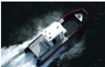
Polarcirkel Workboats are offered in three versions with inboard engines from 130hp to 435hp and lengths of 760, 820 and 860cm.