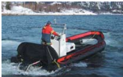
Open Workboats are also available with inboard diesel engines from 130-300Hp.