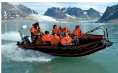
All Polarcirkel Boats are self-bailing and have rigid pontoons filled with polystyrene that make them virtually unsinkable.